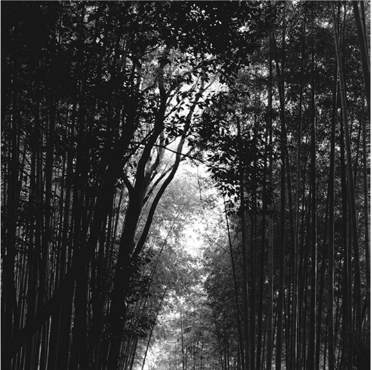
RIEKO TAMURA, Arashiyama, Kyoto 2020 Gelatin silver print, 45 x 45 cm (framed) Edition 3/3 (last available) 1.800 Euro