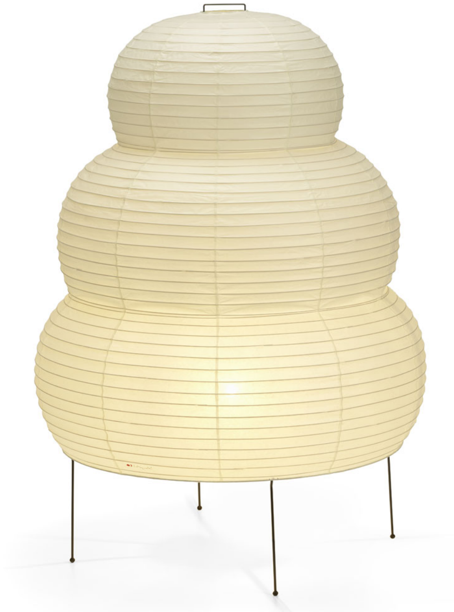
ISAMU NOGUCHI Akari 25N Bodenleuchte 2020 Vitra Design Museum Washi Papier und Bambus Streifen Höher 117 cm, Durchmesser 83 cm 1.599 Euro (available through our partner Markanto)