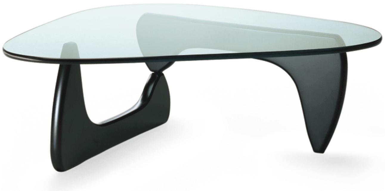
ISAMU NOGUCHI Noguchi Coffee Table (Vitra) Ausführung Esche schwarz, Glasplatte 19 mm 128 x 93 x 40 cm 2.250 Euro (available through our partner Markanto)