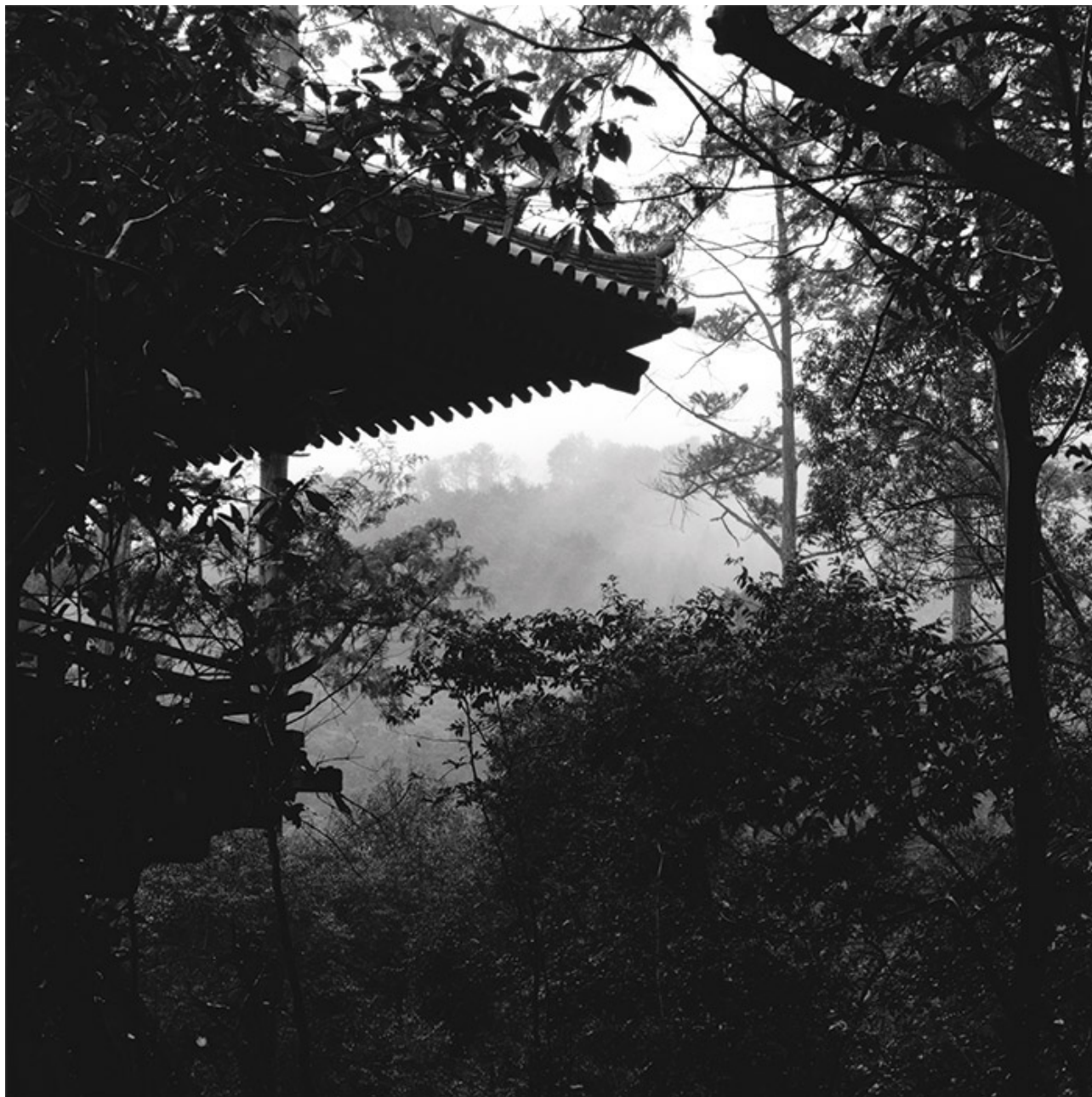
RIEKO TAMURA, Nanzenji #2, Kyoto 2020 Gelatin silver print, 45 x 45 cm (framed ) Edition 3/3 (last available) 1.800 Euro