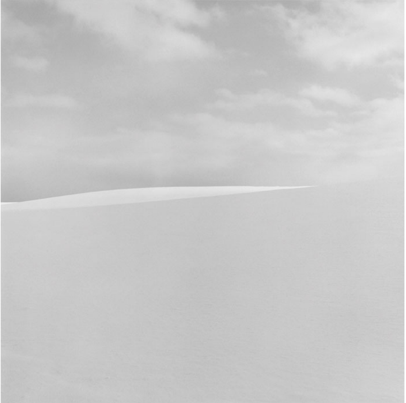
RIEKO TAMURA, Biei #9, 2020 Gelatin silver print, 45 x 45 cm (framed), Edition 3/3 (last available) 1.800 Euro