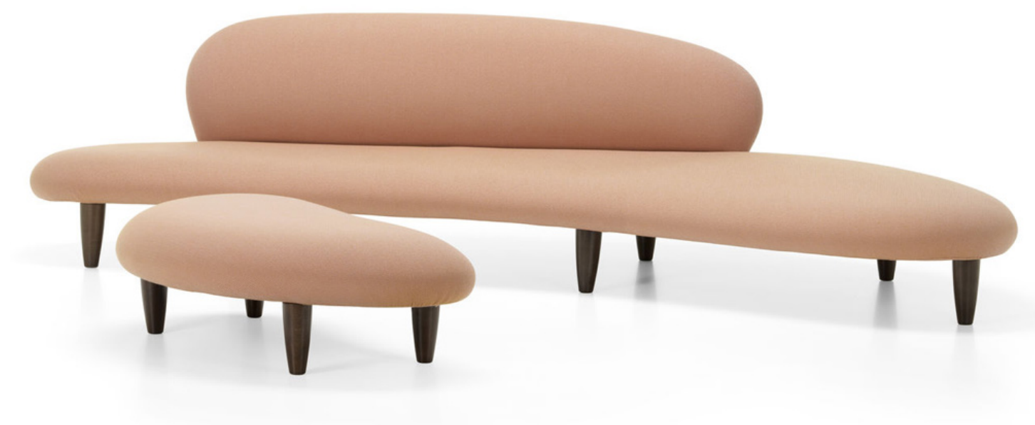
ISAMU NOGUCHI Vitra Freeform Sofa, Entwurf 1946, Sofa and Ottomane, wood and textile Sofa 300 x 130 x 72 cm, Ottoman 120 x 71 x 32 cm 8.360 Euro (available through our partner Markanto)