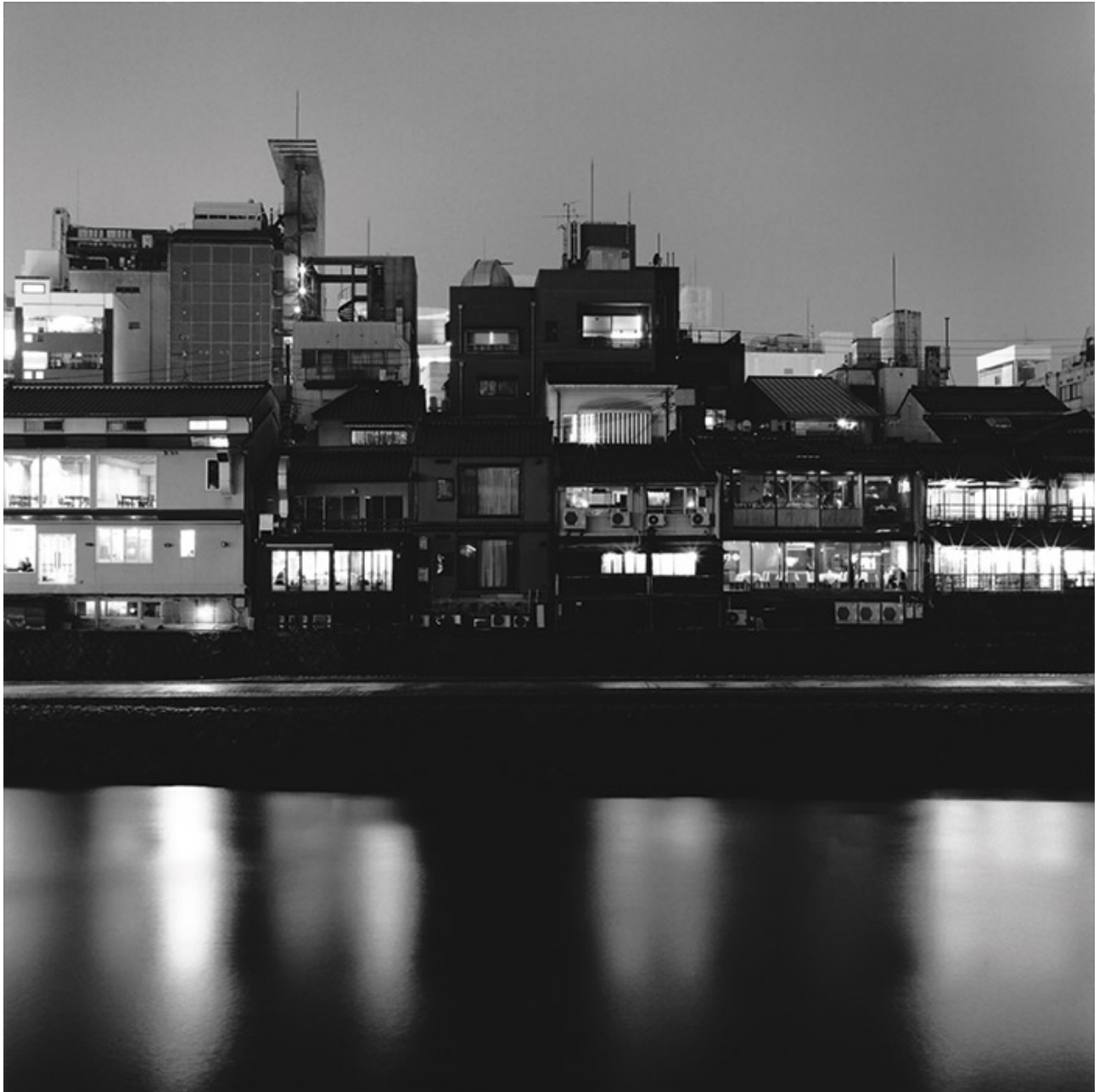
RIEKO TAMURA, Kamogawa, Kyoto 2020 Gelatin silver print, 45 x 45 cm (framed) Edition 3/3 (last available) 1.800 Euro