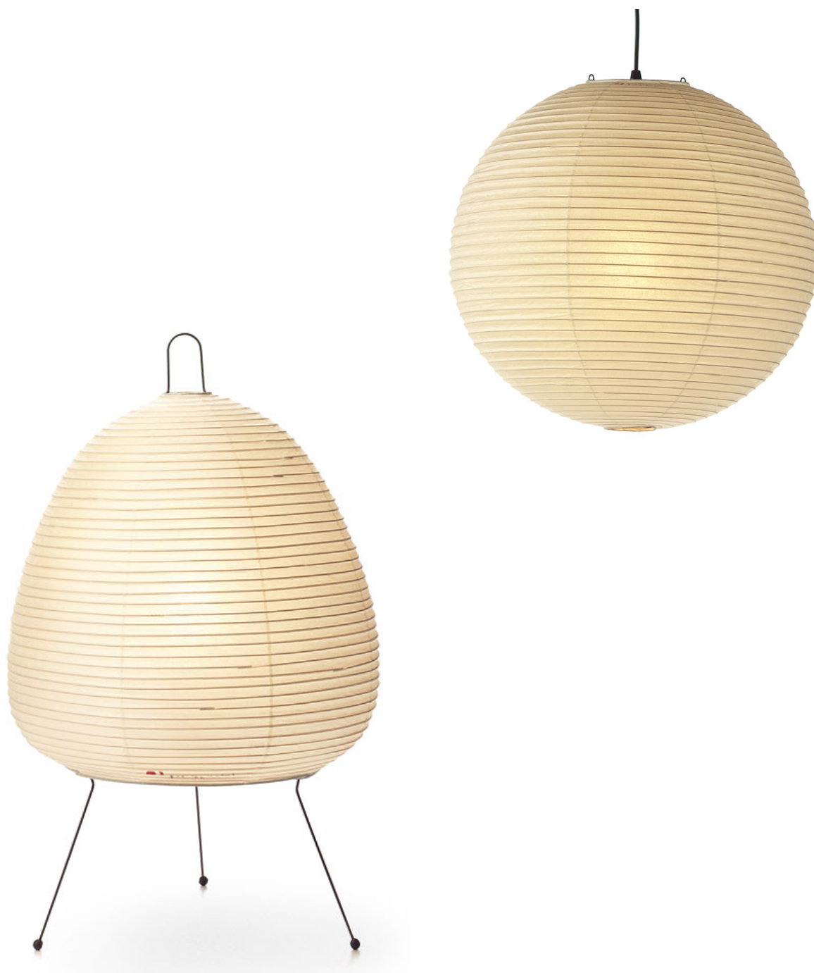
ISAMU NOGUCHI Akari Light Sculptures (Vitra) Akari 45a und Akari 1a Tischleuchte (unten) Washi Papier mit Bambusstreifen Durchmesser 45 cm bzw. Durchmesser 25 cm / Höhe 43 cm 319 Euro & 289 Euro (available through our partner Markanto)