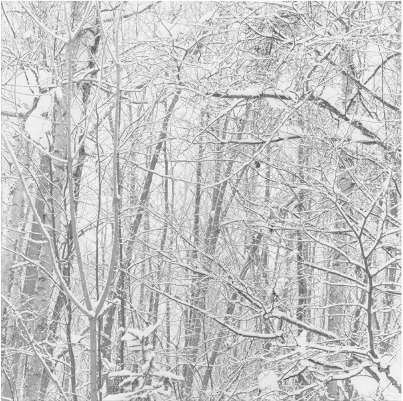
RIEKO TAMURA, Biei #4, 2019 Gelatin silver print , 45 x 45 cm (framed), Edition 1/3 1.800 Euro