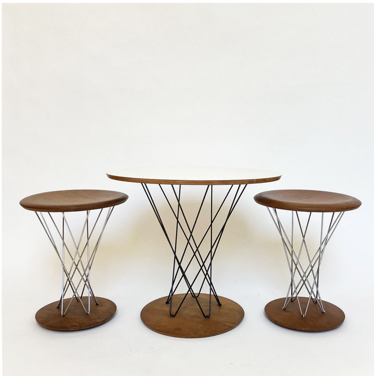
ISAMU NOGUCHI Children's Furniture Group Expo 1959 US Pavillon (Original) Cyclone Table + two Rocking Chairs produced by Knoll 39.500 Euro (available through our partner Markanto)